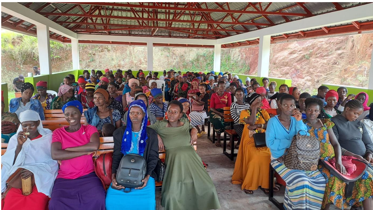
New waiting room for prenatal care – June 2025

Objectives are achieved based on firm and actual commitments from sponsors; therefore, the plans depend on the level of sponsorship ultimately secured.