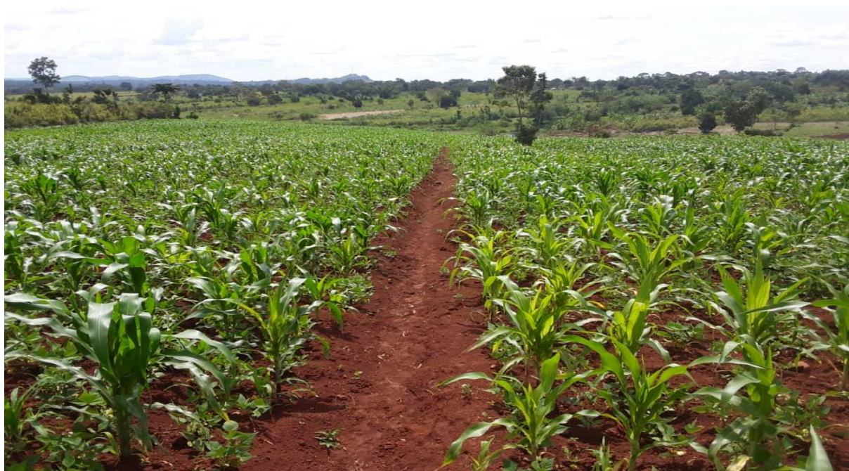
Agricultural (land) for self-sustainability and food security of the poorest

However, self-reliance should not be seen as purely financial. Building self-confidence and self-image among villagers, teenage mothers, and children—strengthening their belief in their own abilities and empowering them through education and life skills—is an essential part of future success (as noted by the mayor in March 2023). The theme “ we can do it ” runs as a common thread through all programs. In addition, education on improved ecological practices, environmental awareness, and healthier lifestyles is imperative.